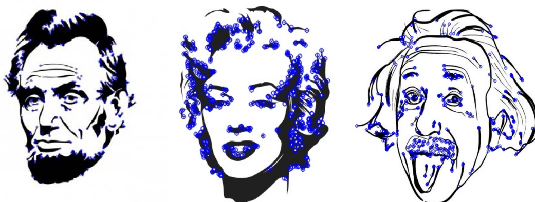
Figure 1 – Reference images with marked KP